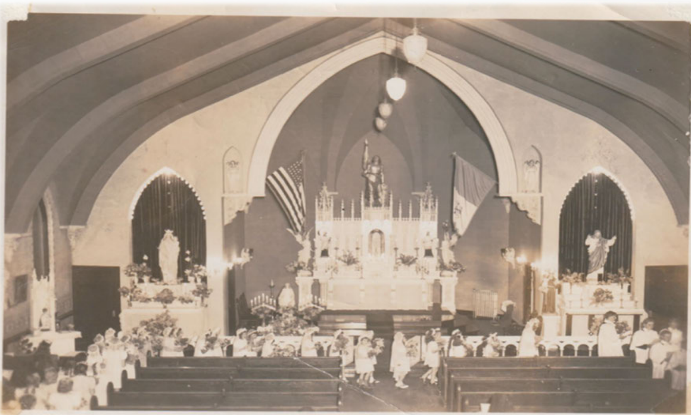
May Crowning Procession, 1946

This archival photo depicts the procession at St. Joan of Arc's 1946 May Crowning, a beautiful tradition in which the youth of the church symbolically crown the figure of Mary as Queen of Heaven and of our lives.